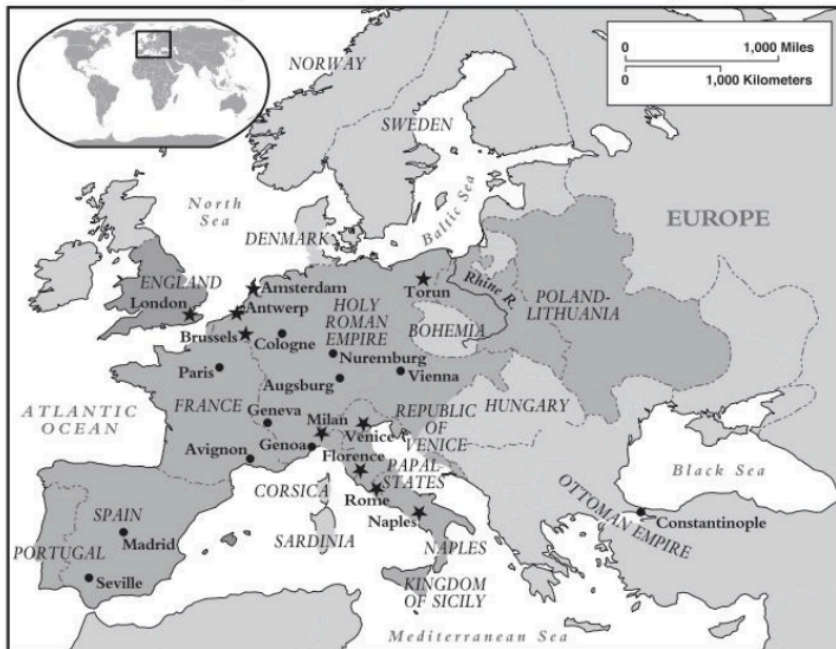
Leading Cities During the Renaissance in Europe

emphasized human concerns. Geoffrey Chaucer, writing in The Canterbury Tales in the late 1300s, portrayed a microcosm of middle-class occupations in England, including several Church positions. His satirical writings portrayed monks who loved hunting and overly sentimental nuns. Like Dante a century earlier, Chaucer chose a vernacular, Middle English, for this work, although many of his other writings were in Latin.